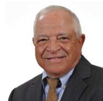
Director since 2002 Age: 68