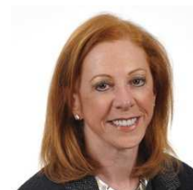
Director since 2012 Age: 55