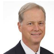
Director since 2011 Age: 54